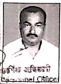
सहाय्यक कार्मिक अधिकारी Assistant Personnel Officer

सहाय्यक कार्मिक अधिकारी कृते मंडल रेल प्रबंधक (कार्मिक) सोलापुर